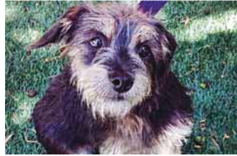
Donny is a 5-month-old mini-schnauzer mix needs a good home.

7 pounds of love and companionship. At 5 years of age, I've learned lots of things. I'm do a great job of walking on leash and I ride nicely in a car but my favorite pastimes are being held and cuddled. I get along great with other dogs and I am very affectionate with women but a little suspicious of men. Please contact Yellow Brick Road in El Segundo if