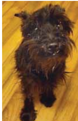
Winnie is a miniature schnauzer who loves to socialize!

Pixies are tiny and that's what I am! I'm an adorable, gentle, female, longhaired Chihuahua who was rescued from a LA county shelter. I had a benign mammary tumor which was removed, and now I'm healed and ready to find my new home. I'm