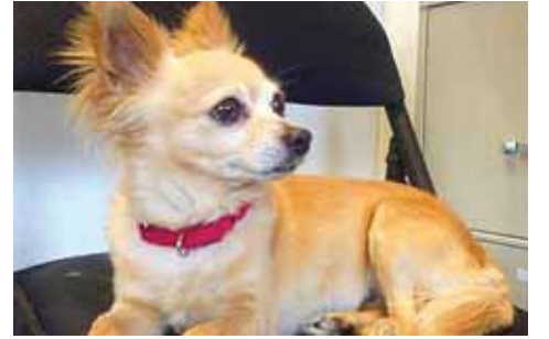
Pixie is a tiny girl who loves to be cuddled.

Please visit all of our Miniature Schnauzers & Friends rescues at the adoptions fair held every Saturday from noon-3:30 p.m. or check out our website, www.msfr.org . Our adoptions fairs take place at Petco, 537 N. Pacific Coast Highway, Redondo Beach, California. Schnauzers! Bet you can't adopt just one! •