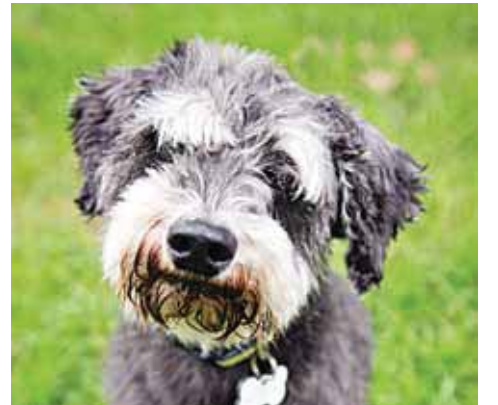
After being in foster care for more than a year, Luke Skywalker has found a new home.

Major drum roll . . . congratulations to Luke and his new Mom. We are so pleased to announce that Luke, our 10-year old Miniature Schnauzer who was our longest foster care boy, has found his forever home. Luke, now named Luke Sky Walker, was rescued from a shelter in February 2013. He required bladder stone surgery and a dental. He is sweet, handsome boy whose new mom is SO very proud of him and she tells everyone that senior dogs make wonderful pets. Thank you to Luke's new Mom for having such a big heart. Adoptions like this are the best. If you have any questions about a particular dog's availability you can email us at info@msfr.org . •